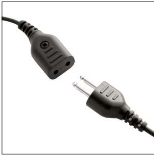
Snap Lock connectors

The Stealth260 can be incorporated into Titan's 1 or 2-wire kits. The key ingredient in Titan's wire kits is the Snap Lock connector, which enables interchangeable earpieces. The connected cable with PTT stays with the radio, while the earpiece is swapped out at shift change, providing a hygienic solution to employee usage. Titan's 1 and 2-wire kits comes with a high quality speech tuned microphone that provides crystal clear communication. Further, the cable comes in braided fiber material, which provides a stronger and more reliable solution for heavy usage.