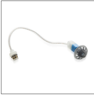
Micro-speaker earpiece used for two-way radio communications.

Stealth260 delivers a unique audio signature, discreteness and optimum comfort. The Stealth260 is the obvious choice for users doing long shifts and wanting a comfortable earpiece that does not cause ear fatigue. The Stealth260 comes in many varieties. Choose between mono or dual mono earpiece and connect to your speaker microphone, or 1-wire or 2-wire communication solution.