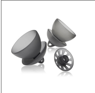
Various ear tips available