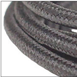
Braided fiber material