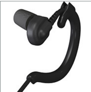
Behind-the-ear hook and 3 different sizes eartips included

The solid Nexus connector enables endless communication options.